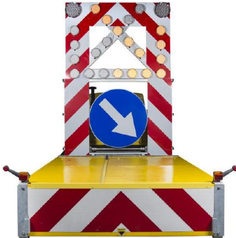
Horizontal crash cushion

More information from the U.K. Representative E-mail: info@the-expansion-joints.co.uk