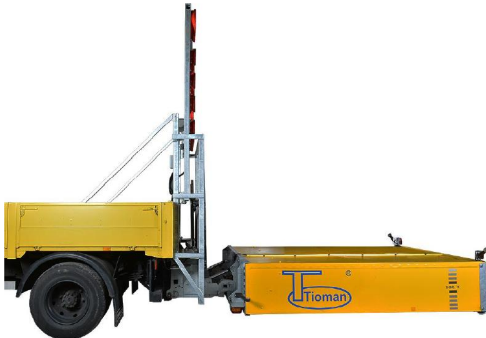
TMA - docking station + adapter