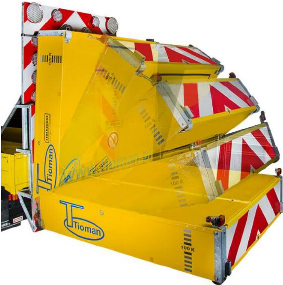
TMA. Graphic illustration of raising / lowering the crash cushion