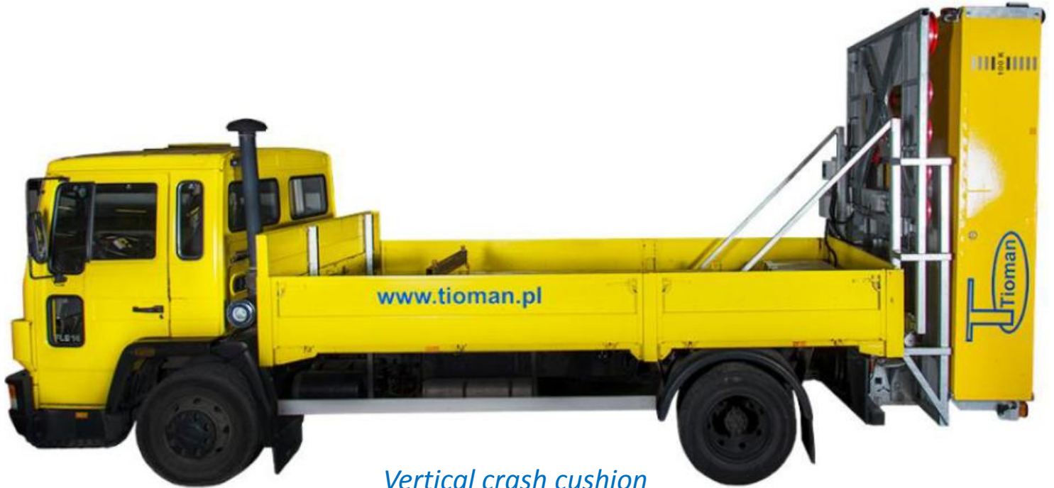
Vertical crash cushion

EXPANSION JOINTS LTD LONDON, UNITED KINGDOM www.the-expansion-joints.co.uk